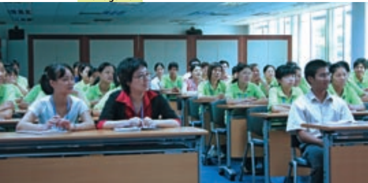
Product development operation training

More and more opportunities will be offered to our staffs in order to cope up with the continuous development of the company.