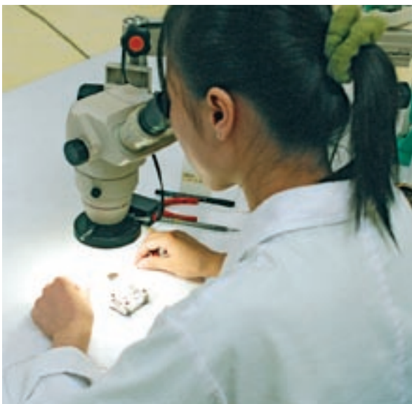
Optical microscope control of a micro-coupler