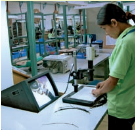
Control of Wi-Fi miniature Pico-Coax® cable

Characteristics : Low cost, low profile, easy to install, can be shielded with an aluminium tape, shield connection on one or several conductors.