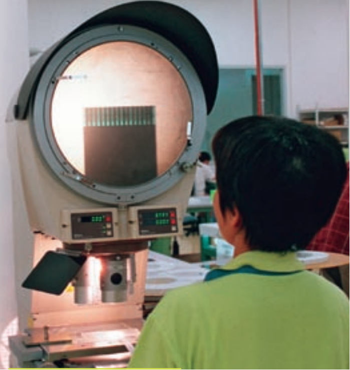
FFC Pitch control with profile projector