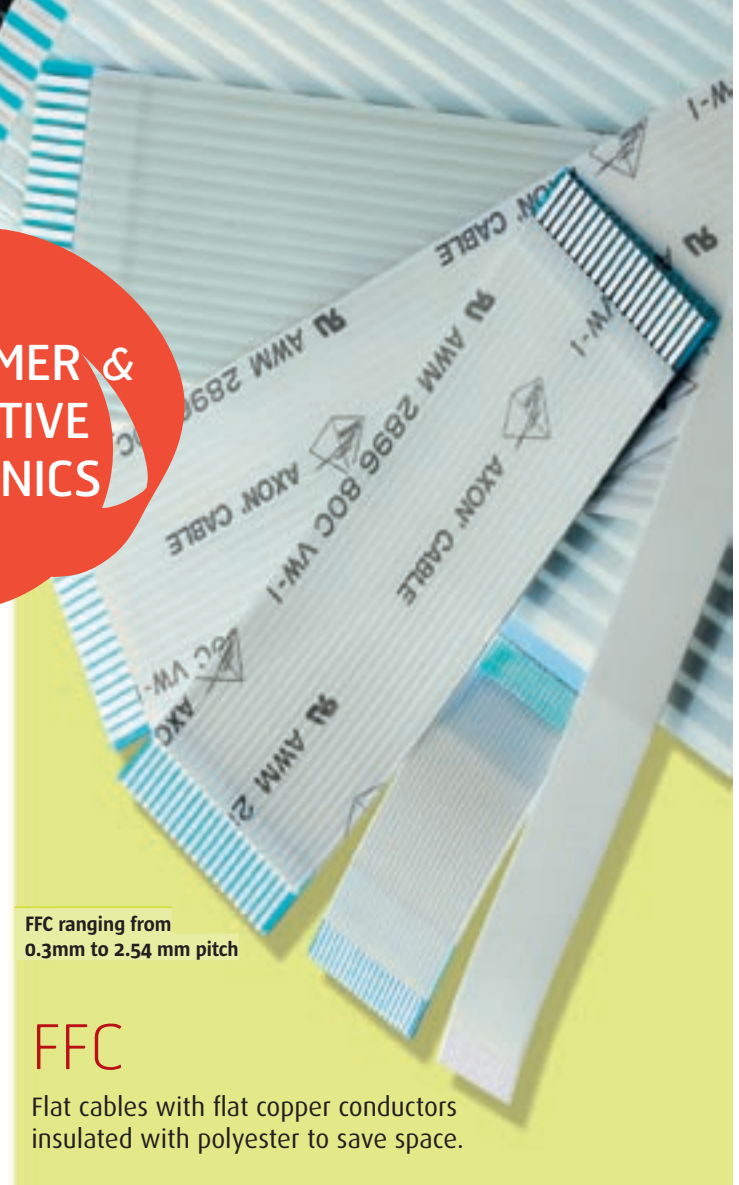
FFC ranging from 0.3mm to 2.54 mm pitch