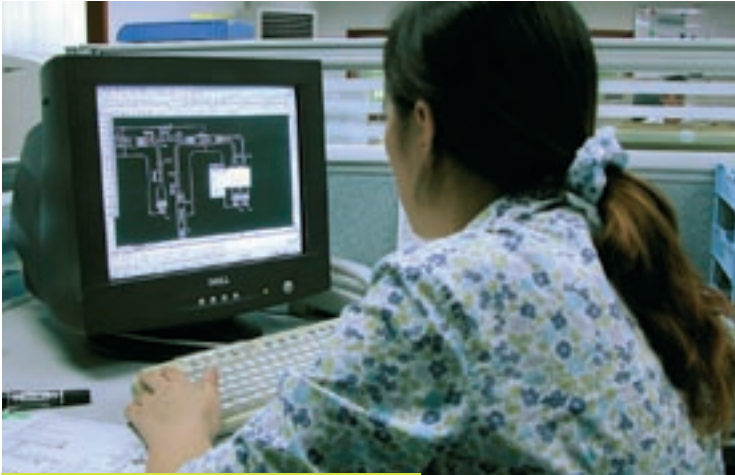
Chinese Engineer designs high tech assemblies

In term of market orientation, the Company positioned itself in producing high quality, high interconnect products and decided to offer high quality, high technology interconnect solution and as well the best service to its asian customers.