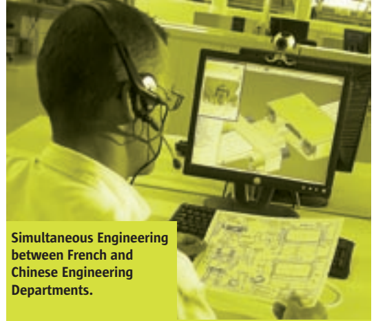
Simultaneous Engineering between French and Chinese Engineering Departments.