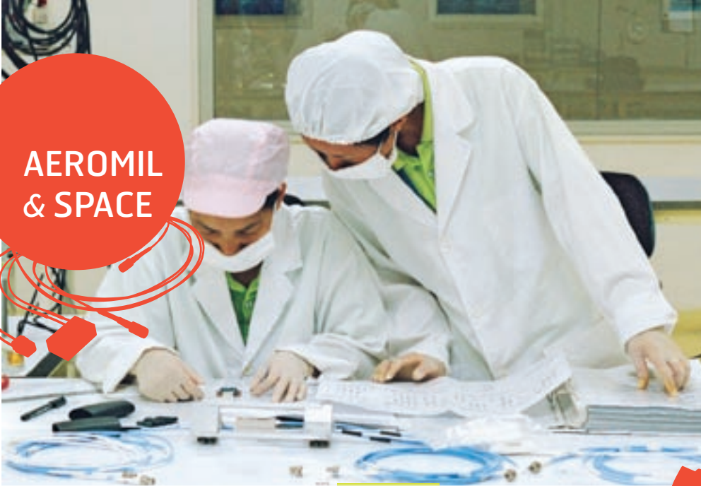
The clean room