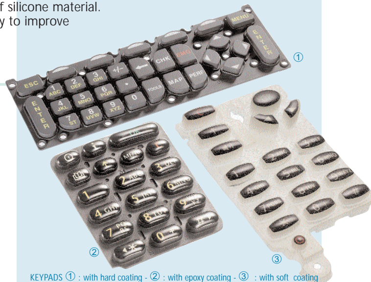
KEYPADS ① : with hard coating - ② : with epoxy coating - ③ : with soft coating

ADDIX SAS 31, Impasse Prudhon 94204 IVRY SUR SEINE CEDEX - FRANCE TEL. : + 33 1 46 72 65 04 - FAX : + 33 1 46 58 12 00 e-mail : sales@addix.axon-cable.fr http : //www.addix.fr